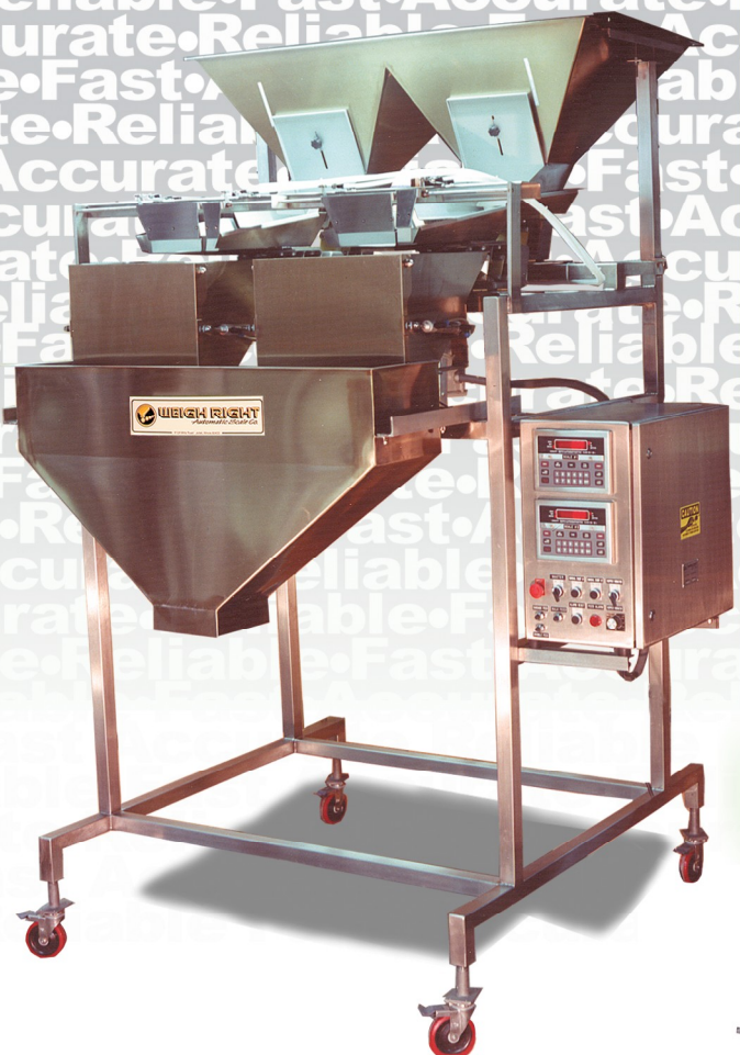
Model PMB-3602 (Shown with Stainless Steel Frame and Flap Gates)