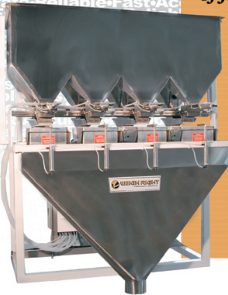
Model PMB-4-FL Shown with frame to mount on top of bagger

Filling systems for 2 lb. to 100 lb. fills of free flowing products.