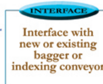
Model TA Take Away Conveyor