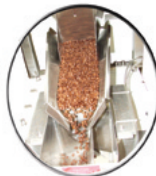
Top view of coffee beans streaming into the flip style weigh bucket

The iQ-FLiP can be supported on a split support frame over the transition funnel of your bagger or mounted to the top plate on most vertical baggers. The short stack-up height is minimal compared to multiple lane linear scales and combination scales yet offering high speed filling.