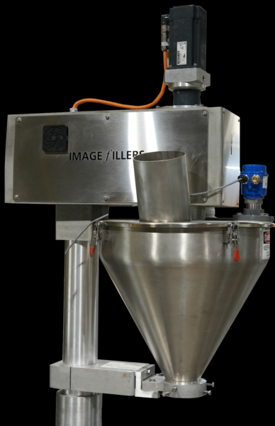
Image 2K Semi Automatic