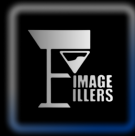
Image Fillers Inc.

Fill coffee, spices, nutraceuticals, viscous products, & liquids