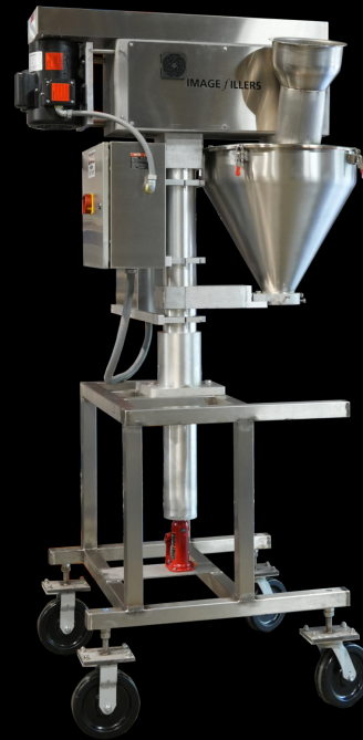
Image 2.5K Semi Automatic

Fill between 1 gram & 50 lbs Built for speed and accuracy with a smart PLC.