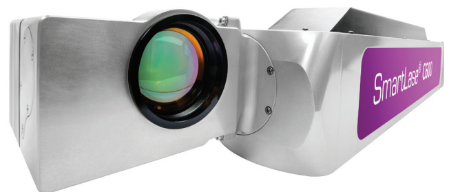
Equipped with the X-WIDE large area printhead you can do so much more with fewer printers!